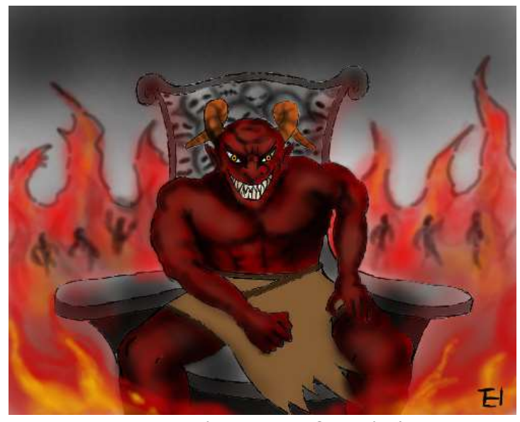
There is a cost for sin!

John 3:36 Daya adi sabah di Anak dapŭd udip adi sawŭ adi tan adu adu, pak daya adi nyibireu pinganang Anak dŭh-i re dapŭd udip anŭ; ayŭh re ruro di ribo ukum Tapa.