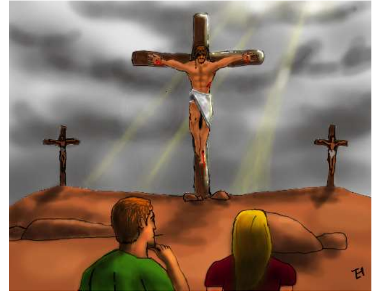
Why did Jesus die?