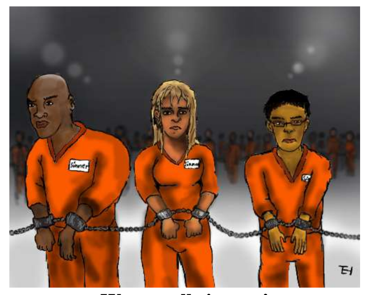
We are all sinners!

Rome 3:23 barang naan mbuh bidosa ka mbuh jo so Tapa adi nyiramat ngara.